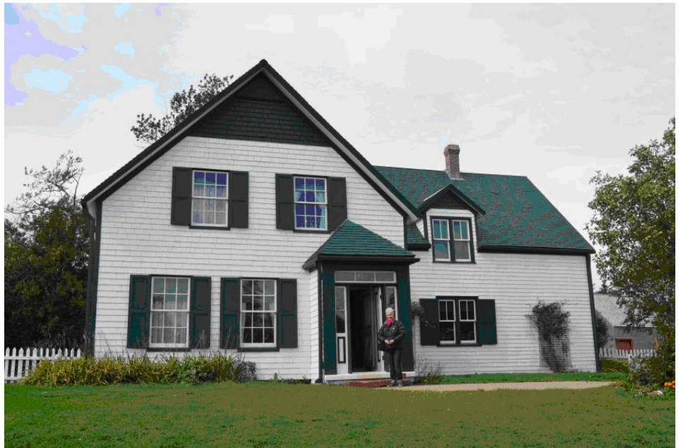
At "Green Gables", Prince Edward Island, Canada. The inspiration for the house in LM Montgomery's "Anne of Green Gables".

That's easy, I was born in 1946. Verse 4? I was born in the 4 th month. How's that for a personalised message? "All the days ordained for me were written in your book before one of them came to be". Psalm 139 v. 16